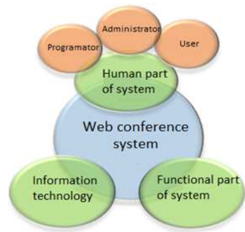
Figure 1 Parts of web conference system

Basic elements of web conference systems are human part of the system, functional part, software and information technologies [4]. On the lower levels of hierarchy can be these elements considered as independent systems which consist of other elements as shown in Figure 1.