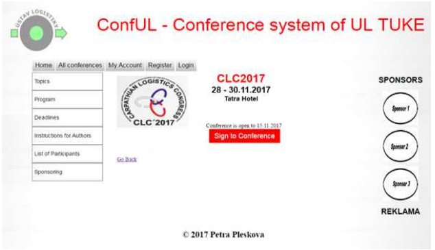
Figure 4 Display event

ConfUL represents a user friendly and reliable system (Figure 3) capable of transmitting big amount of information between its users and database in the real time. As programming languages we used PHP, Html, CSS and also the database MySQLi.