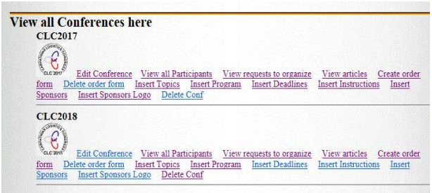
Figure 9 View all conferences here