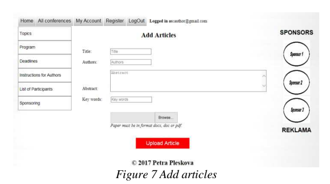
The role of participant can sign to conference and create order as shown in Figure 8.

The role of author can add paper to conference and create order (Figure 7).