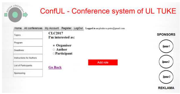
Figure 5 Set role to conference

role of organizer, other organizers or systems admin must confirm our role. If they reject this demand, we will get the role of author (Figure 5).